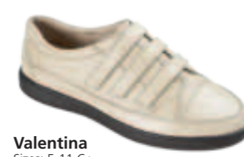
Valentina Sizes: 5-11 C+ Black, Hazelnut, Buttermilk* $139 95