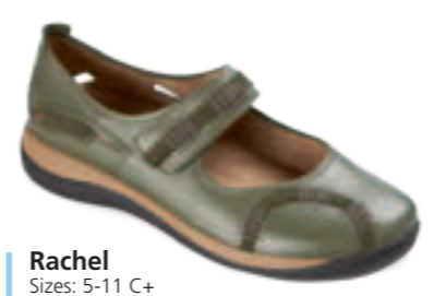
Rachel Sizes: 5-11 C+ Black, Ruby, Oyster, Forest* $129 95