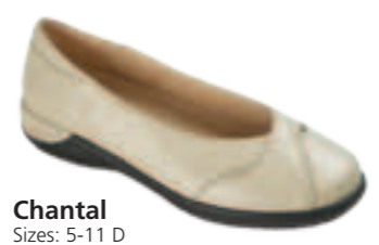
Chantal Sizes: 5-11 D Black, Navy, Ruby, Buttermilk* $139 95