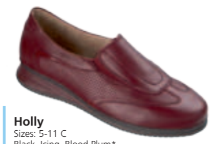
Holly Sizes: 5-11 C Black, Icing, Blood Plum* $149 95