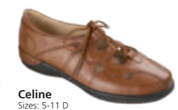
Celine Sizes: 5-11 D Black, Navy, Buttermilk, Rosewood* $139 95