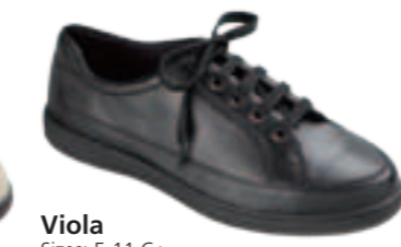
Viola Sizes: 5-11 C+ Ruby, Buttermilk, Navy, Black* $139 95