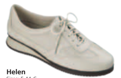
Helen Sizes: 5-11 C Black, Blood Plum, Icing* $149 95