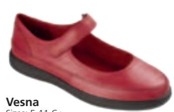
Vesna Sizes: 5-11 C+ Black, Buttermilk, Hazelnut, Ruby* $129 95