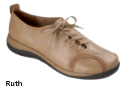
Ruth Sizes: 5-11 C+ Black, Navy, Oyster* $139 95