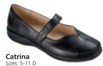
Catrina Sizes: 5-11 D Rosewood, Ruby, Forest, Black* $139 95