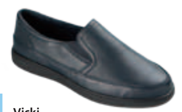
Vicki Sizes: 5-11 C+ Black, Hazelnut, Navy* $139 95