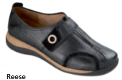
Reese Sizes: 5-11 C+ Oyster, Forest, Black* $139 95