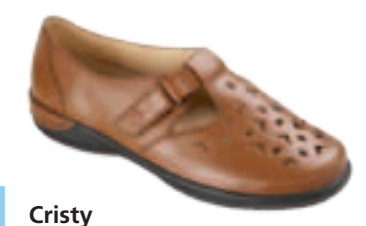
Cristy Sizes: 5-11 D Black, Ruby, Rosewood* $139 95